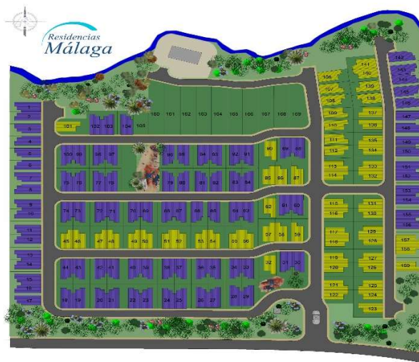
Diseño de Sitio Malaga Ciruelas